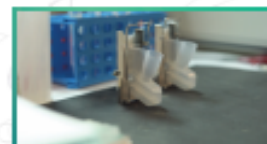
KYTOFUNNEL, KYTOCLIP Megafunnel for Specimen Preparation, Cyto Clip required for megafunnel preparation