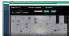
AI-PAP AI Assisted PAP smear analysis system