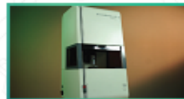
DIGISMEAR AS20X AI powered Slide Digitizer

CerviSCAN is an indigenized system for screening of cervical cancer using methodologies of AI and Robotics which makes population screening for Cervical Cancer feasible.