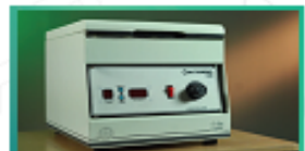
KYTOSPIN Mega Funnel Centrifuge