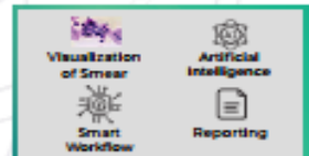
DIGITAL CYTOLOGY FRAMEWORK Smart Pathologist Workflow